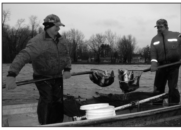
Hatchery technicians net walleyes during the spawning "run"

The summer's agenda concluded with the hatchery's raising an additional 38,000 advanced five-inch "fall fingerling" walleyes, which were stocked into the Black River (Lewis County) and Lake Pleasant (Hamilton County). Building on past efforts, we reared and stocked paddlefish and round whitefish in New York as part of the endangered species program. After hatchery