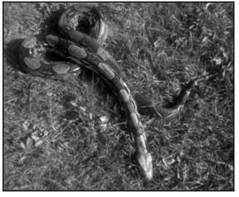
Boa constrictor found by Destiny USA in June 2014.

For more information regarding laws, regulations, identification, etc.., of non-native species, please view any or all of the following websites: