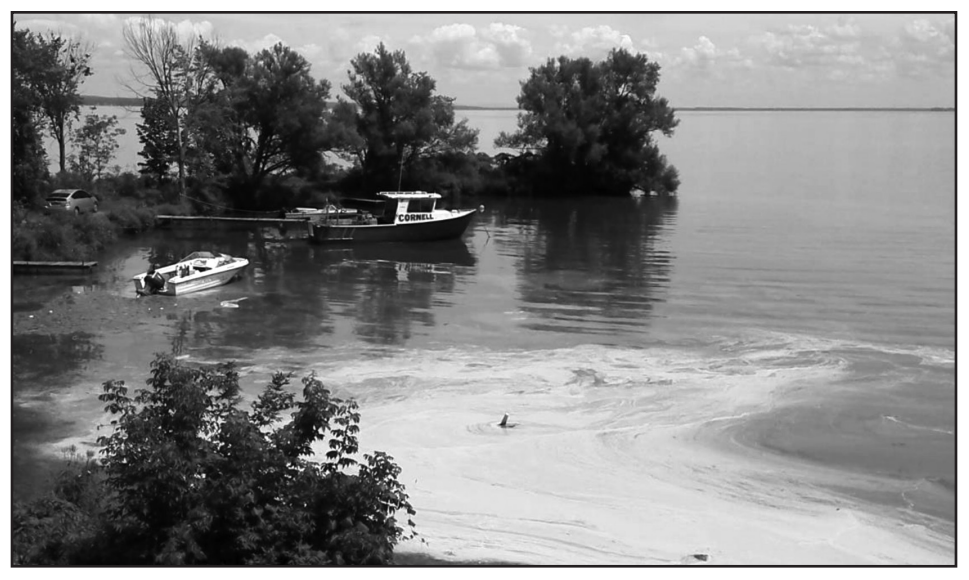
Oneida Lake Shackelton Point Harbor – Summer 2013