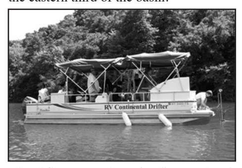
The "Continental Drifter," Hamilton's research vessel.

Bathymetry involves studying and mapping depths of lakes and oceans. The Continental Drifter staff's current agenda entails production of a new, high-resolution, digital bathymetric map of Oneida Lake's bottom, or "bed." This is an ambitious task. The Hamilton research crew has enjoyed two productive summer seasons on the lake, but has only mapped the eastern third of the basin.